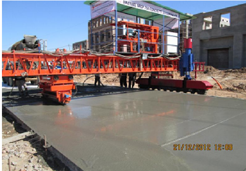
BACK VIEW AFTER FINISHING