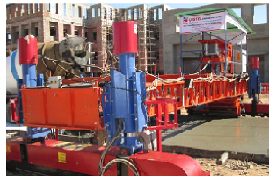
HEAVY DUTY HYDRAULIC JACK