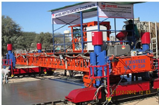
VIEW AFTER FINISHING