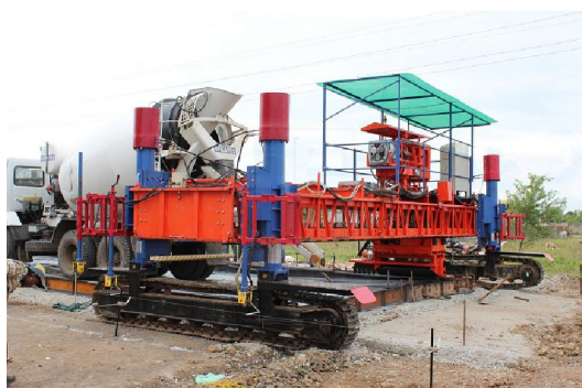
MOBA GRADE & STAIRING SENSOR